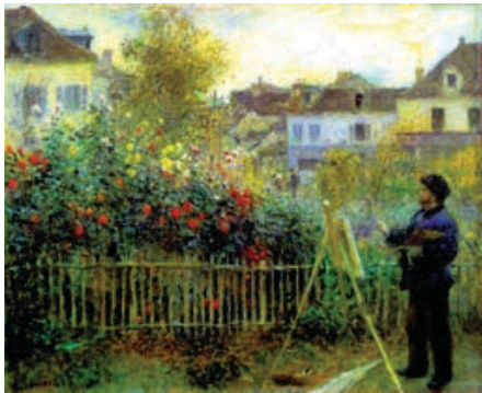
Renoir's painting, "Monet painting, in his garden", 1873, oil painting.