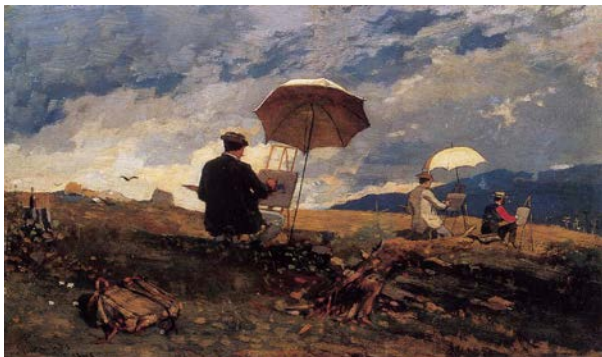
"Artists Sketching in the White Mountains" by Winslow Homer, 1868, oil painting.